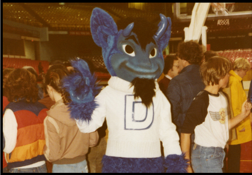
A DIBS THROWBACK FRIDAY WHEN HE WAS KNOWN AS "BILLY BLUE DEMON"!